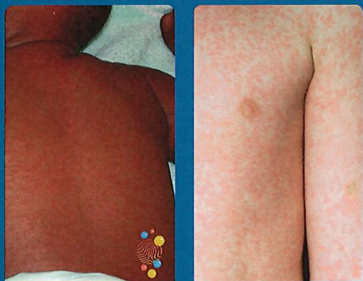
What a measles rash can look like

Measles usually starts with cold-like symptoms followed by a rash. Some people may also get small spots in their mouth. It can sometimes lead to serious complications such as blindness, pneumonia, meningitis, and sepsis - causing a real risk to life.